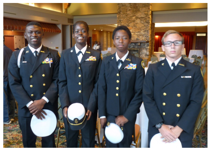
Fantastic JROTC Color Guard Southeast Guilford High School