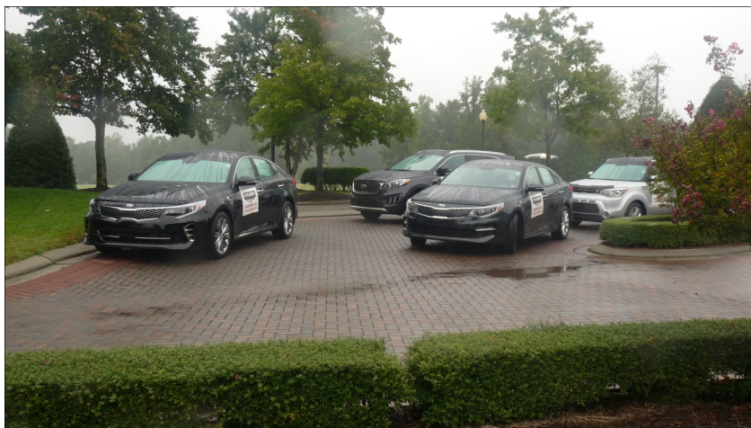
Thanks to Battleground Kia for Their Continued Support