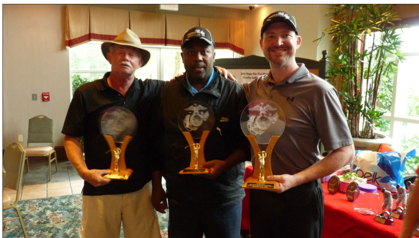
Team members of the 1st Place Team with their trophies. They are from Air Products, Inc. Well Done.