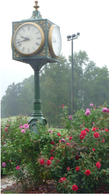
It's Tee Time at Grandover Resort