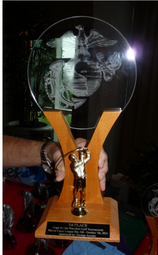
The Ultimate Prize 1st Place Trophy