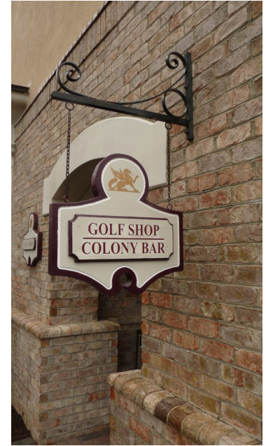
Pro Shop & Bar Entrance Grandover Resort